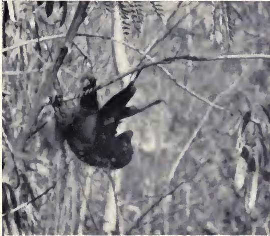
FIG. 81. Pteropus ornatus , showing method of moving around in trees, New Caledonia.

no indication of abandonment. In another case two Frenchmen, MM. Henri Berlioz and Auguste Le Bouhelke, knew of one big camp, which they visited every year previous to the war. When American troops were sent to New Caledonia, a division training area was established on and surrounding the site of this particular camp. If flying foxes occupied the camp during this period they